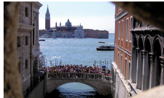
© Nikater - Tourist flows on the Ponte della Paglia near St. Mark's Square

Venice is seen as a metropolis and as an international city. It is a UNESCO World Heritage site since 1987 and is running to become European Capital of Culture in 2019. It attracts intellectuals, researchers, artists and students. These personalities should interact and become part of the city to turn it into a laboratory for new kind of practices.