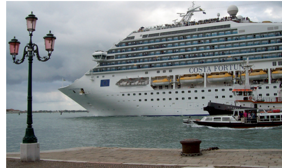
© Alena Sobotova - Cruise ship crossing St. Mark's Basin

The administration of Venice seems to have succumbed to economic interest, as evidenced in the proliferation of advertising