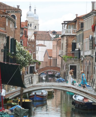
Water shapes Venetian life (view of the canal of San Barnaba)

Reflections were further made on best practices in historic cities that seek to achieve a socially, culturally and economically sustainable development. One of the central problems identified were the vested interests which steer and bias development processes in Venice. Again, a call was made to improve administrative structures and management policies and to develop a healthier connection between culture and economy. When the overall challenges are complex and extensive, the first step has to be to break the problem down into smaller units, which can be addressed one after the other.