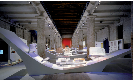
© Asy arch · The Biennale Architecture Exhibition

The question 'What makes a creative city?' was first conceptualized by highlighting concepts such as fabric, density, platform, and balance. It is often said that creativity is facilitated by the specific social fabric of a city that encourages artistic and creative activities. In Europe, Berlin is one of the prime examples of a creative city, where cheap rents and beautiful spaces attract artists from all over the world. Berlin offers both inexpensive living and an exceptional density of cultural activity, whereas a city like Paris lacks the former and many Eastern European capitals lack the latter.