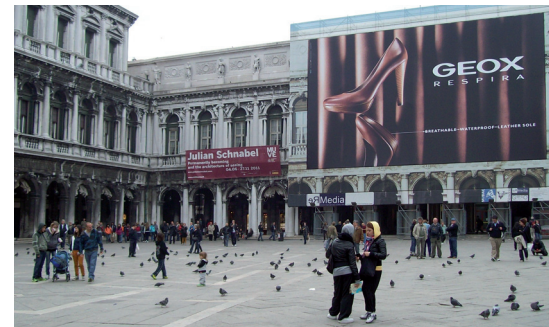
Advertising on the restoration worksite of the Ala Napoleonica facade in St. Mark's Square

While the large and diversified range of restoration projects supervised by the Superintendency constitute an important step towards the ongoing preservation and revalorization of Venice, yet more restoration work needs to be addressed especially to counter the water-inflicted damage to the foundations of the city's fabric. Future efforts should focus on the requalification of the industrial cultural heritage (e.g. lagoon islands and Porto Marghera).