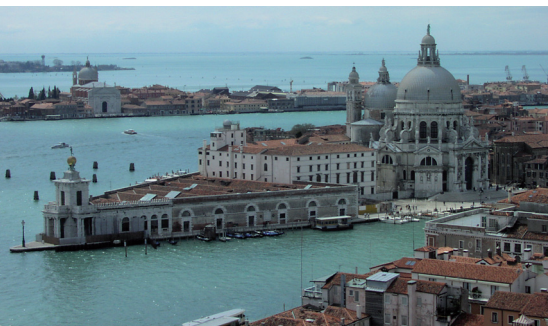
Aerial view of the Punta della Dogana

Presentations offered a review of selected restoration projects that involved renewed public and private commitments towards the preservation and enhancement of the city's cultural heritage. These included: extensive restoration campaigns of the popular area of San Marco, the Arsenale complex and the Grandi Gallerie dell'Accademia; the opening of three new museums, thanks to renovations financed by private foundations (Punta della Dogana by the Pinault Foundation, the Magazzini del Sale with the help of the Vedova Foundation, and the Cà Corner della Regina financed by the Prada Foundation); significant large-scale recuperation works among which the requalification of the old Manifattura dei Tabacchi to house the Cittadella