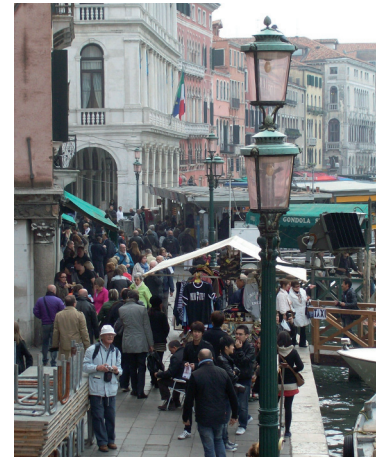
The crowded area of Rialto

Venice is in clear and urgent need of a rich, diversified and sustainable cultural tourism policy and better tourism management that considers, first and foremost, the wellbeing of the local community. Every year, Venice is visited by approximately 22 million tourists, of whom just four million stay in Venice over night, and only two million visit one or more cultural attractions, such as museums or art exhibitions. It was thus pointed out that tourism in Venice is not to be considered as 'cultural' at all: in fact, tourism in Venice could be better described as "free-riding on the city's cultural beauty".