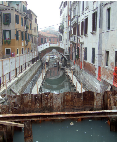
Dredging of a canal with repair of the embankment walls

as the Palazzo Ducale, in order to achieve a more balanced number of visitors throughout the year. Moreover, the municipality is trying to attract tourists from different regions and emerging countries, and encourage them to consider travel in off-peak seasons. This initiative could for instance include cooperation with travel businesses in Asia, from where large numbers of tourists come to Venice every year.