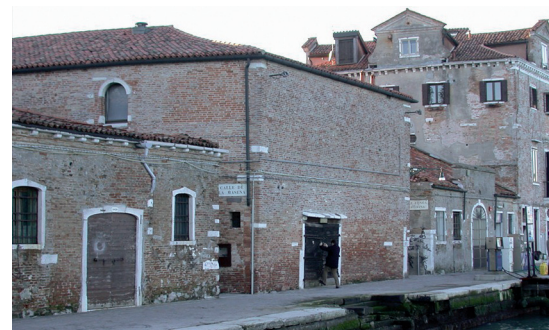
Teatro Fondamenta Nuove

The example of the new theater Teatro Fondamenta Nuove was presented to illustrate another way in which new initiatives can contribute to processes of creative revitalization in Venice. This theater for emerging artists and new artistic expressions, with a focus on contemporary performing arts, is a place geared towards residents rather than tourists. It is a private theater running on a modest budget, but it nevertheless tries to craft a diverse and balanced programme that caters to different tastes and involves young people from Venice. This way, the theater not only covers a previously empty niche of the cultural offer in Venice, but also stimulates the local community – especially youth, be they involved as the audience or as prospective artists and performers – by offering the opportunity to familiarize with some of the most valuable international trends in the fields of music, dance, theater and performing arts. Some of the programming and production strategies also include the use of residency both to support artists as well as to create a stronger sense of community for different audiences.