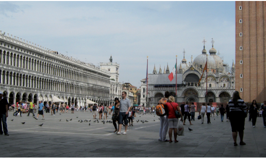
© Elitsa Syarova - View of St. Mark's Square with the recently restored facade of the Procuratorie Vecchie

The function of Venice as a unique practice laboratory for conservation activities, providing excellent learning opportunities where in-depth knowledge of materials and techniques are key prerequisites for successful restoration, was highlighted. The need for sound organization and good planning, which strongly influence the success of a project, was emphasized: in particular technicians should be well informed about the intended use of historical buildings before restoration work is begun.