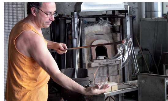
© Wknight194 - Glass blowing at a Murano workshop

Not only can stories contribute to the maintenance of Venetian history and support the residents' memory of the past: they can also teach visitors, tourists and newcomers how to better appreciate, understand, and even love the city. It should not be forgotten that the first defenders of the city are often those visitors or 'non-Venetians' who are accused of exploiting it. Through a good communication, an international community can better connect to this extraordinary place and better understand its current situation. The Venetian stories and voices - such as the special voice of the ancient Saint Mark's bell, reaching us unchanged through millennia of history - can help to "educate" the tourists, and to some extent "Venetian-ize" them, thus preventing some of the problems related to mass tourism and reinforcing the side of those committed to protect this very special place.